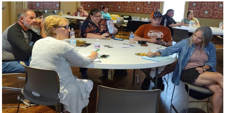
Workshop held in August for our Business and Building Owners