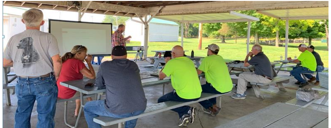
Tree Trimming Workshop

This cut is used to remove a branch all the way back to the stem.